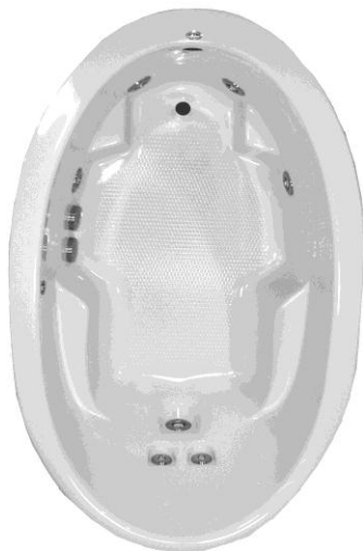
72"x42"x26" Shipping weight - 160lbs

Inside Bottom Dimension 48"L x 29"W (+/- 1/2")