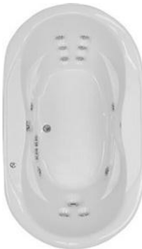
72"x42"x27" Shipping weight - 165lbs

Inside Bottom Dimension 41"L x 24"W (+/- 1/2")