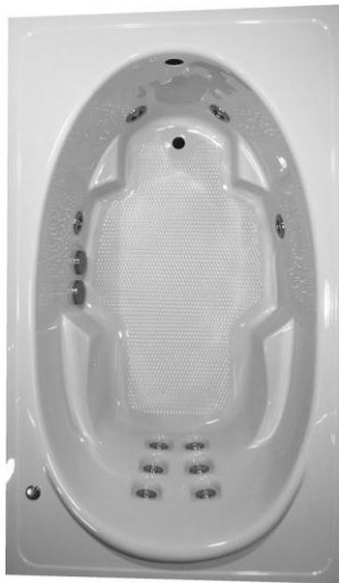
72"x42"x23" Shipping weight - 200lbs

Operating Gallons - 55 gal. reg. usage 95 gal. upper body usage Upper body jets can be shut down for operation at a lower level