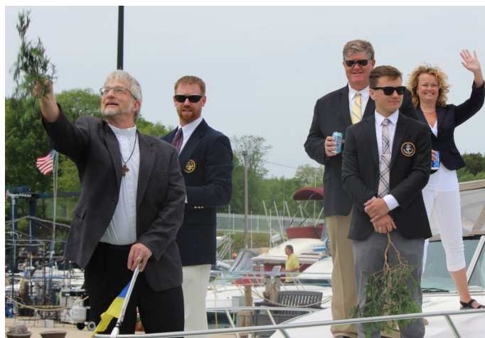
The Blessing of the Fleet