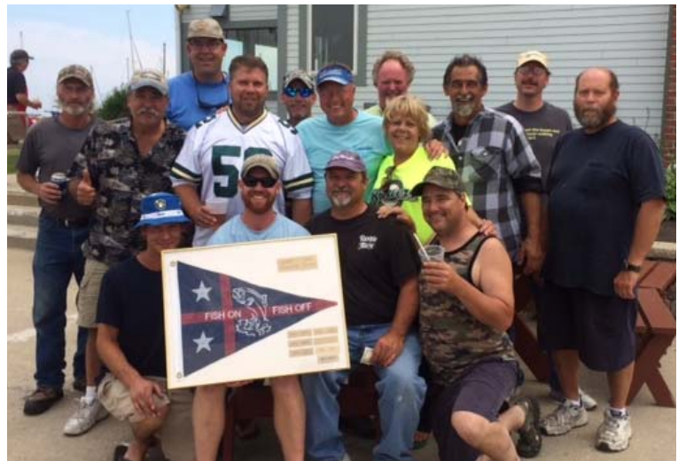
SMYC Fishing Captains and crew celebrate after bringing the SMYC vs. SSSC Fish-On/Fish-Off Traveling trophy back to South Milwaukee