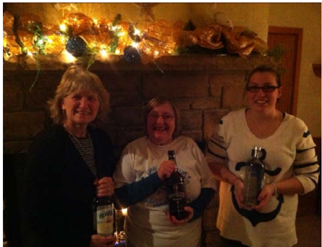
The winners of the ornament contest at the annual SMYC Trim-A-Tree night show off their winning ornaments