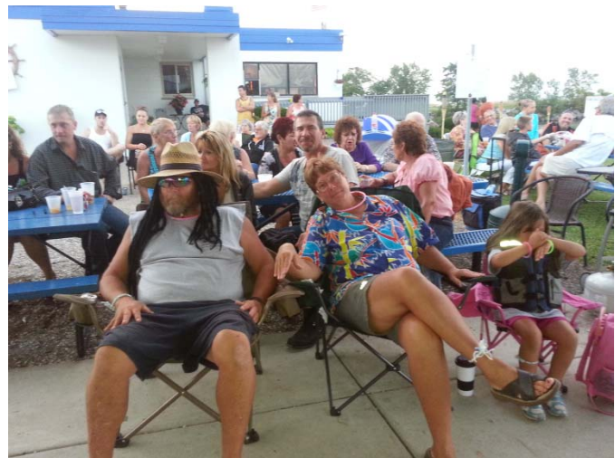
SMYC'ers take in the band during SMYC's annual open house weekend