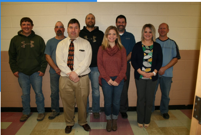
Munich School Board

Research proven interventions such as strong school policies have been shown to decrease the number of youth who ever start using tobacco. This is important as the overwhelming majority of tobacco users start before the age of 18 years leading to a lifetime of tobacco addiction and harmful tobacco related health outcomes .