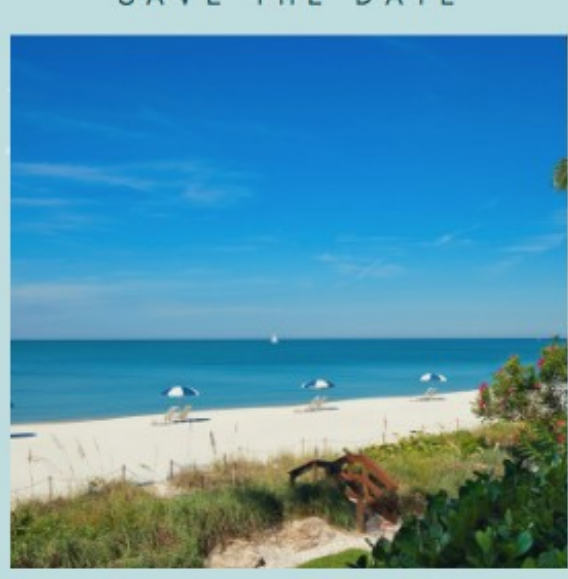
HBAV ANNUAL CONFERENCE