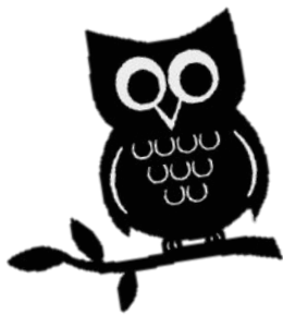
Ethics & Sustainability