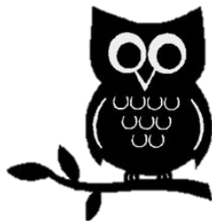
HR CC&I (Cultural Competence & Inclusion)