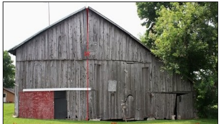
(1) Ralph (2) Herman (3) Levi Bartels ( a) Barn (b) Shed (c) Neighbors. Pictures taken 1931 and 2013

www.americanbarnandwood.com ♦ American Barn & Wood ♦ info@americanbarnandwood.com ·