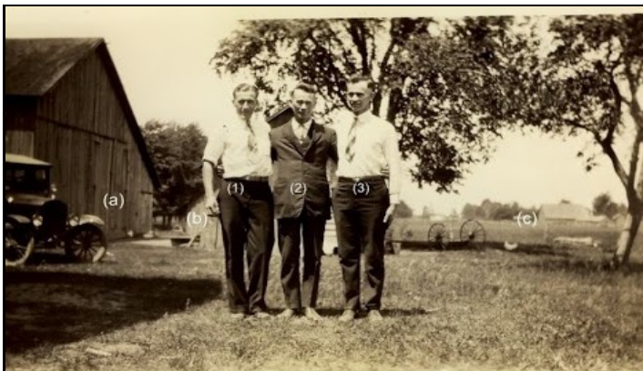
South side of the barn in 1930 and in 2013