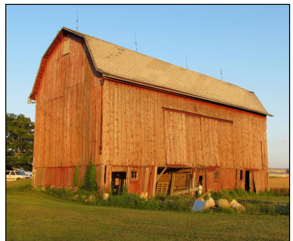
One of the last sunsets to fall upon the Hastings Barn.

The Past: Built in the 1890's, the Hastings Barn was at one time a working dairy barn with ample hay and grain storage. It had the classic gambrel style roof which allowed for more storage of hay in the loft. Through the years it has had several owners; the last one owning it for 50 years. Being a bank barn, it was built next to an embankment which allowed for the cattle to enter below and the farm equipment to be store on the main level. At the time of dismantle, the barn had an ornate and fully operational hay trolley and tongs system.