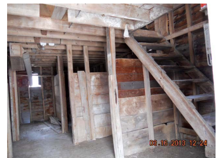
Wooden Stair case to top loft