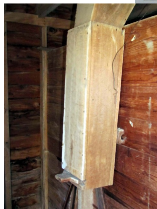
Grain chute with stop/go paddle board