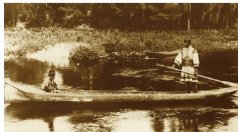
St. Lucie County Historical Museum

Between 1700 and the present, the culture of the Florida Seminoles has remained remarkably connected to its roots while also innovating in dramatic fashion. This lecture explores this dynamic to show how the Seminoles have embraced this dualism of being both modern and traditional. It examines, among other things, their origin stories, dress, cuisine, housing, ceremonial life, and family life.