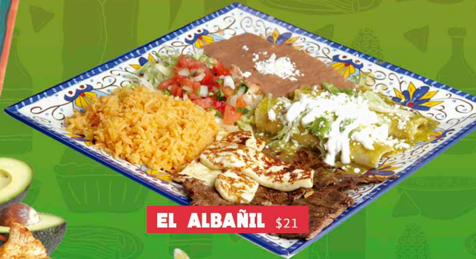
EL ALBAÑIL $21