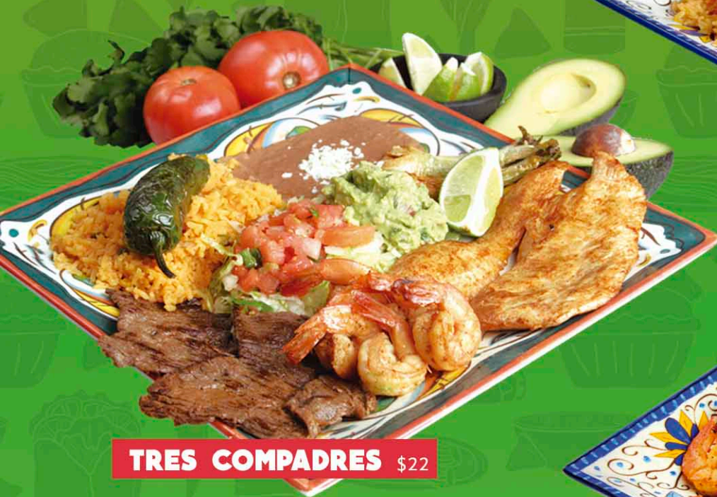
TRES COMPADRES $22