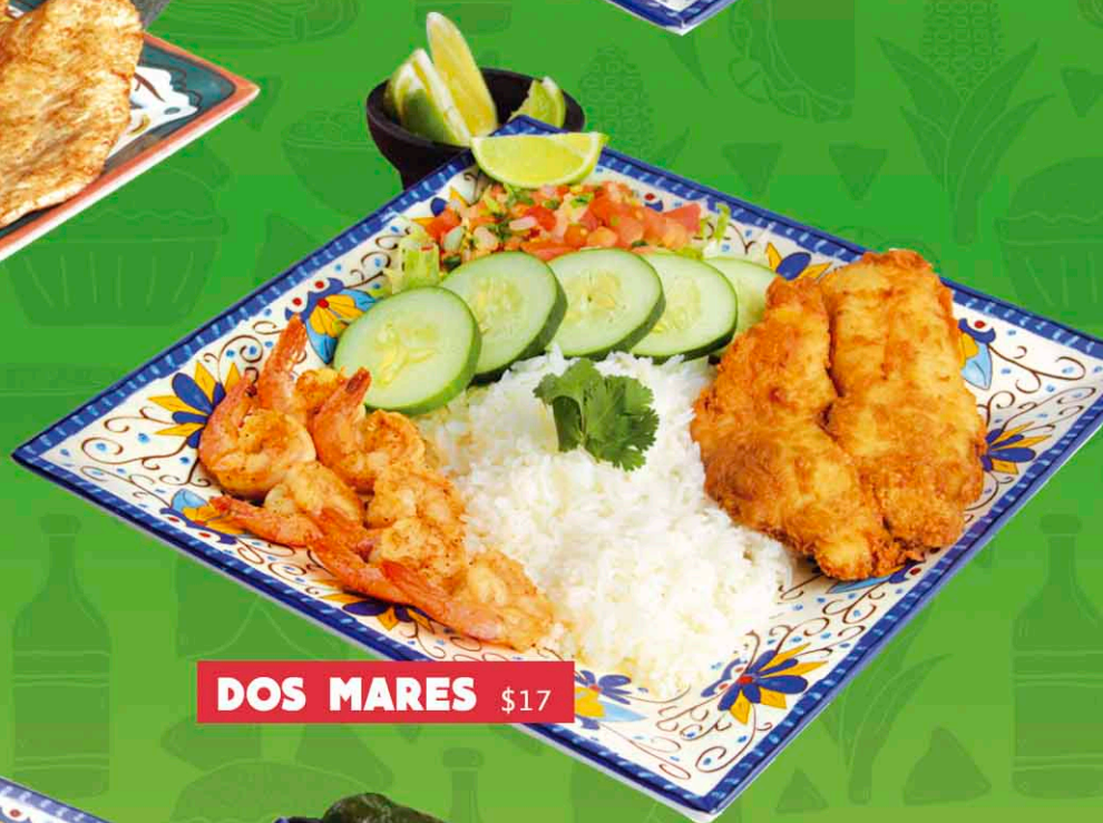
DOS MARES $17