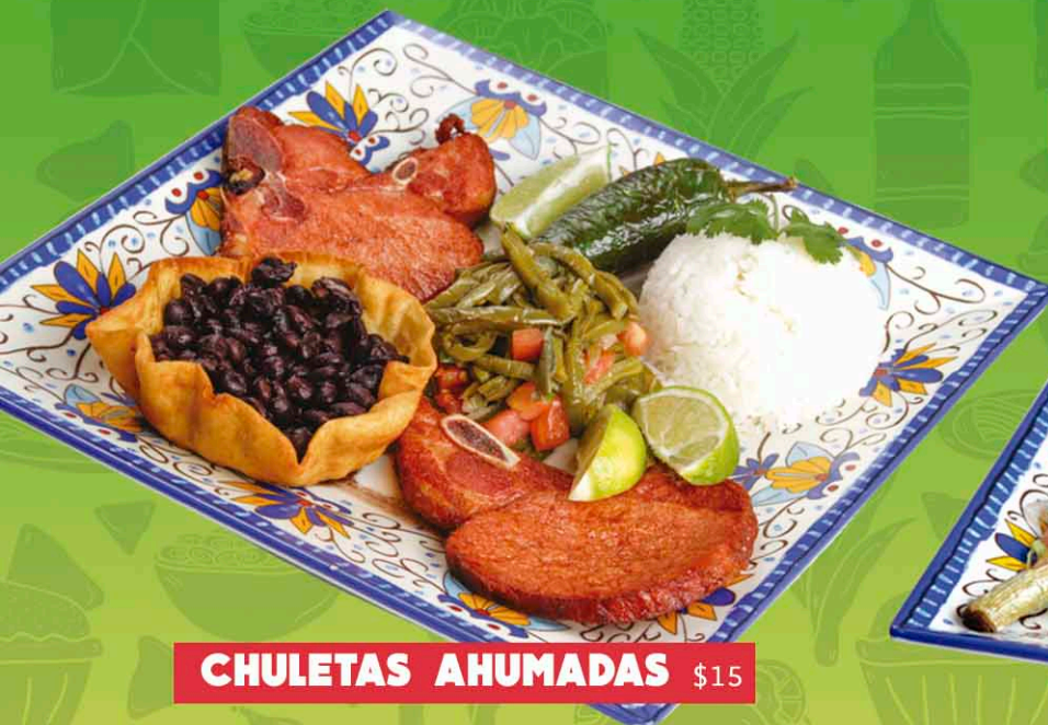
CHULETAS AHUMADAS $15