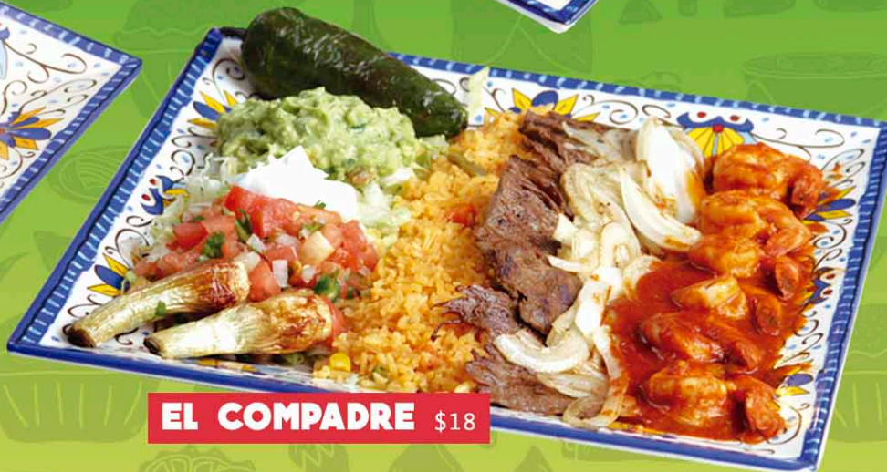
EL COMPADRE $18