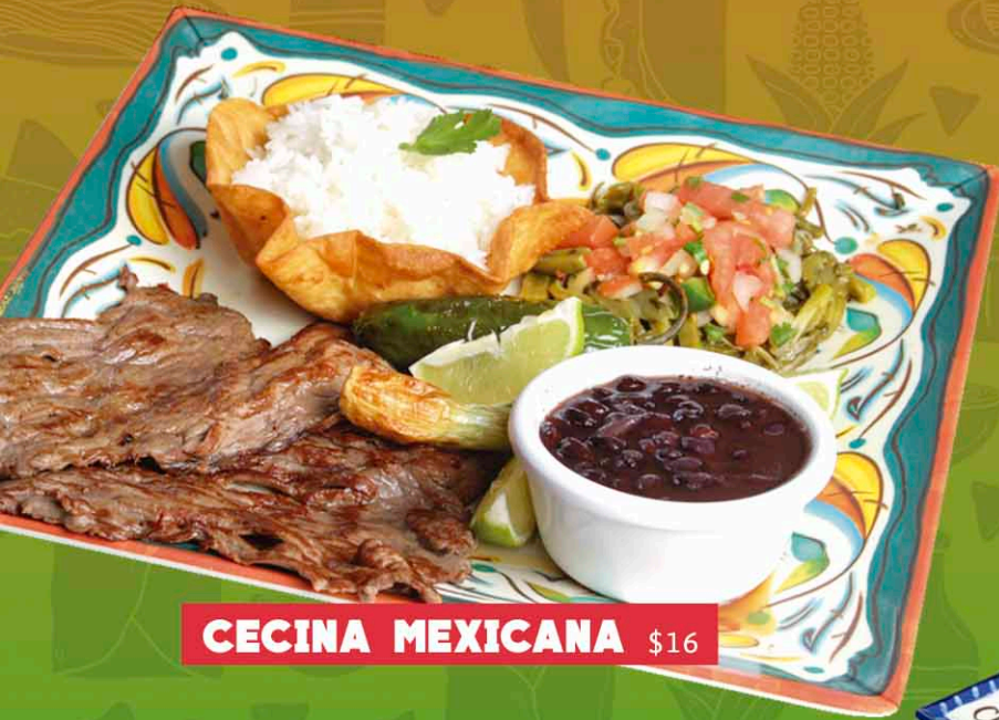
CECINA MEXICANA $16