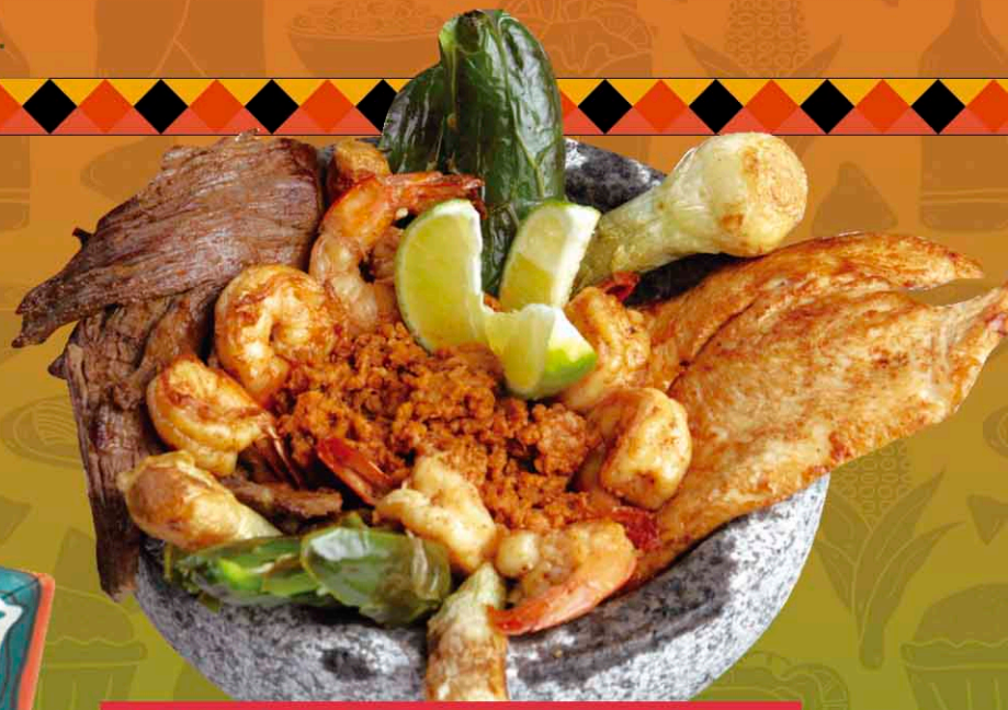
PICADERA DE MOLCAJETE $28