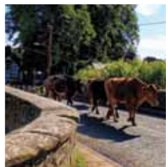
Beautiful Berriew