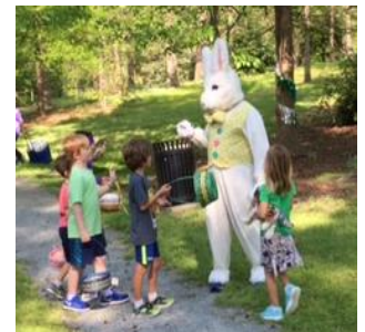
April 2017: Easter Egg Hunt with Delancey Street Easter Bunny.