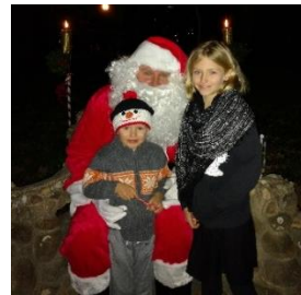
December 2016: Holiday Gathering in the Park.