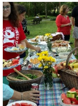
June 2017: Potluck Supper at the King's Chair.