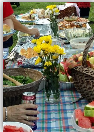
The June 2017 potluck table.