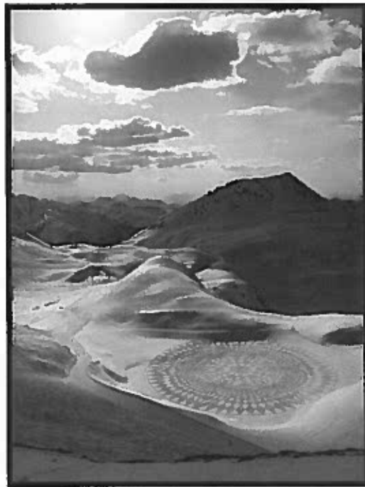
Snow Art by Simon Beck