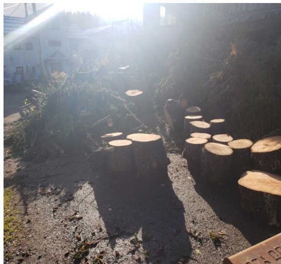
Bay Street Tree Removal October 24 th , 25 th and 28 th