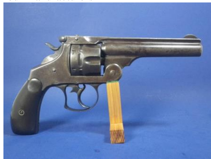
S&W .44 DA “Russian” Revolver