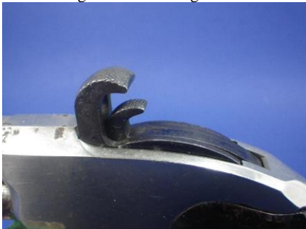
The larger cocking lever acts as an extractor, loader and hammer cocking device