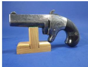
National Arms Model No. 2

design already started under Moore’s guidance. These little gems proved so popular that the Colt Firearms Co. which purchased National in 1870, continued producing them for another ten years. Therefore, we find practically identical deringers with a possible three addresses and makers. The Model No. 1 in all-steel construction and the Model No. 2 with iron frame and rosewood grips. National was in business for only five years, and only about 3,000 were made with the National name. The deringers are solid, with a side-pivoting barrel and an extractor attached to the left side of the breech which hooks under the rim of the .41 short rim fire cartridge and pulls it clear of the barrel when it is opened. A spring-loaded button on the right side unlocks the barrel and allows it to pivot to the left. The sides of the frame are factory engraved, and the barrels blued. National also made a large-frame teat-fire revolver based on Moore’s famous Williamson’s patent front-loading revolvers, this one in a specially designed .45 caliber teat fire cartridge.