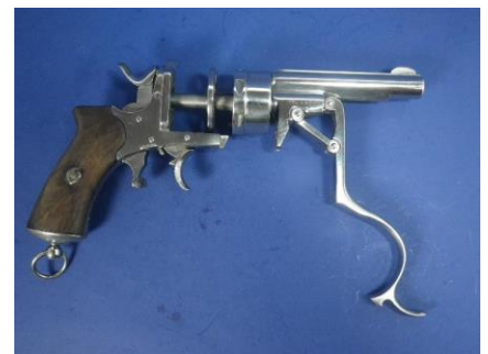
Very fine Galand 1872 self-extracting revolver in 12mm center fire, with Liege proof marks