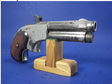
Remington – Rider Magazine Pistol