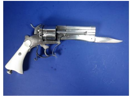
A big revolver with a folding knife. Mid-19th century