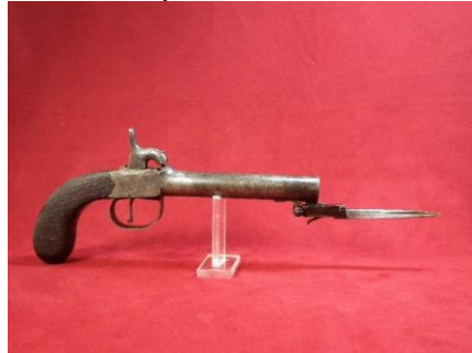
A rare, English made percussion pistol with spring-loaded bayonet I had for only a short while. It sold in a snap (pardon the pun...)