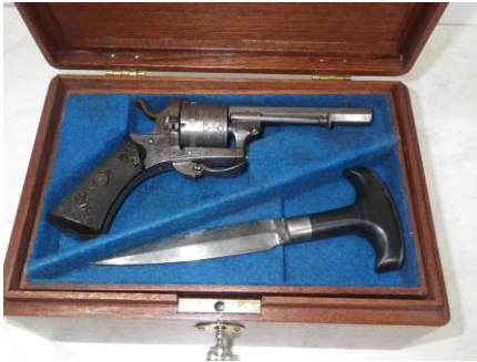
This is how it all started: my first pin fire I brought back from England, with a custom push dagger.