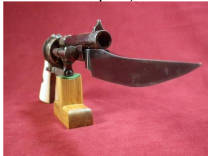
Mint condition Joseph Chaineux revolver with mounted bayonet / knife. I forged the knife to fit the gun's knife-mount based on historical examples..