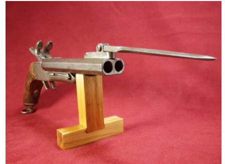
Double-barrel pin fire pistol with top-mounted, folding bayonet

Combining guns with a cutting / stabbing weapon goes back to the very beginning of firearms manufacture. There are many examples of match lock, wheel lock, flint lock and percussion pistols attached or incorporated into the design of knives, daggers, swords and cutlasses. Some were ingenious, others rather silly, and many of questionable effectiveness. Their intent was more to act as a deterrent to would-be attackers than a genuine defensive alternative. Even today there are manufacturers who produce gun-knives (or knife-guns?) but those, too, are more of a novelty than a viable means of defense.