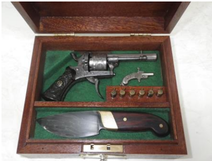
A 5mm pin fire revolver and a 2mm single shot pistol with a miniature Damascus hunter.