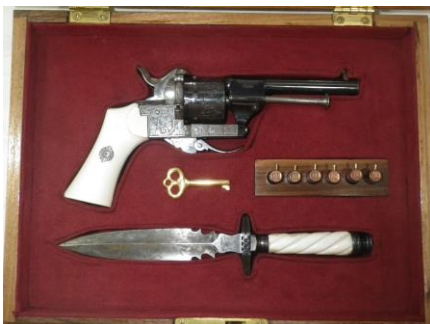
Another mint condition revolver with a matching boot knife

On the other hand, there are the knife and gun combinations. There are many variations, from simple blades and bayonets added to the gun barrel, to intricate pocket knives, daggers and swords with integral guns. If you are lucky enough to find one of these, hold on to it, because they are extremely hard to find!