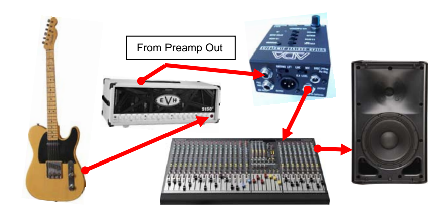
Diagram 5: Guitar to amp head to GCS-3 to sound reinforcement system – no stage amps.