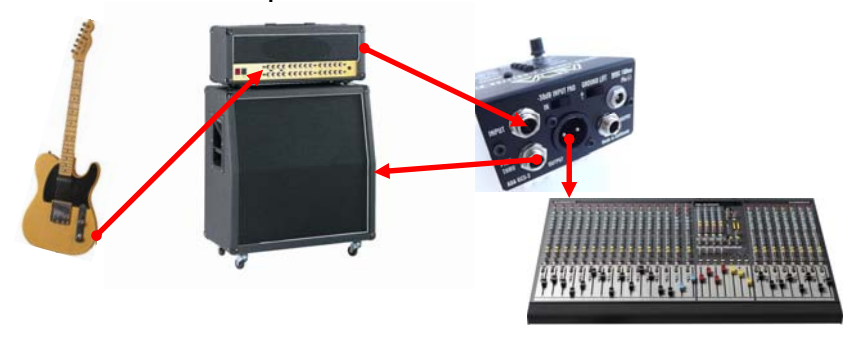
Diagram 4: Guitar to pedal board to GCS-3 to the recording or PA console.

4. Record in silence while listening through headphones. The sound in your headphones is so dynamic and realistic that your inspiration will allow you a wholesome freedom of expression.