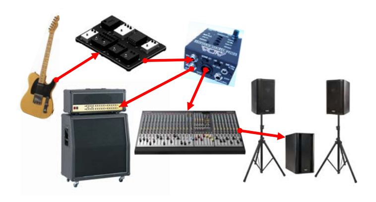
Diagram 2: Guitar to pedal board to GCS-3 split via the THRU jack to your stage amp and the processed signal to the house sound system {\sf SCS}