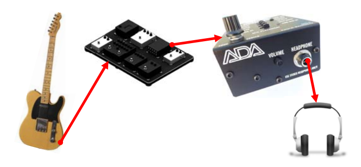
Diagram 7: Guitar to pedal board to GCS-3 to your headphones.

7. Listen to what your pedal board will sound like through a speaker cabinet. The sound in your headphones is very dynamic and realistic.