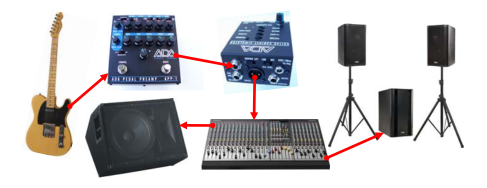
Diagram 6: guitar to GCS-3 to GCS-3 to headphone mix and to studio monitors.