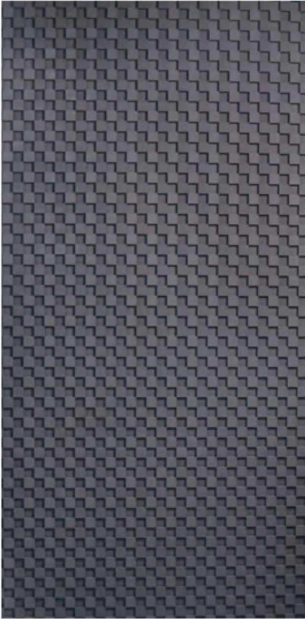
Full panel view