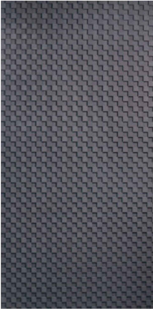
Full panel view