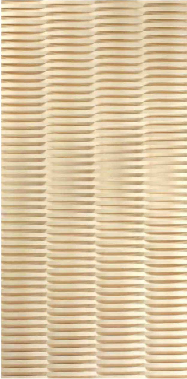
Full panel view