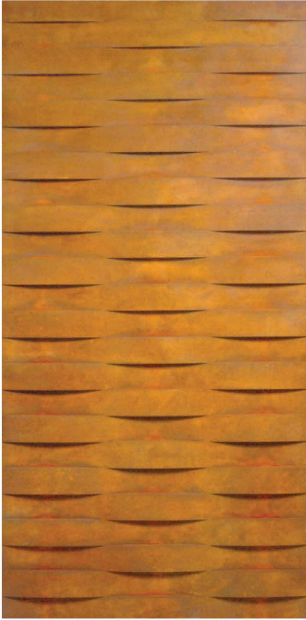
Full panel view