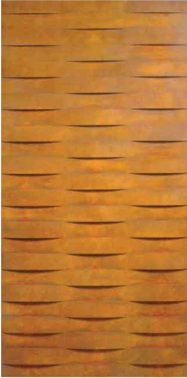
Full panel view