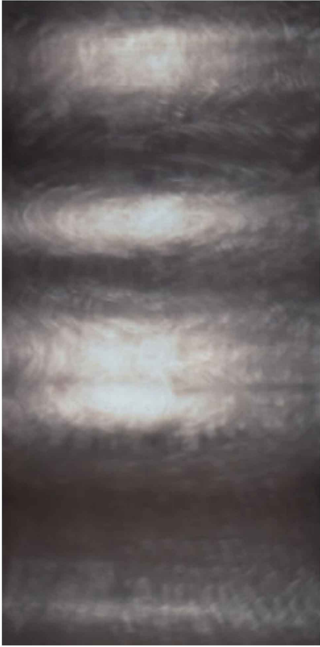
Full panel view