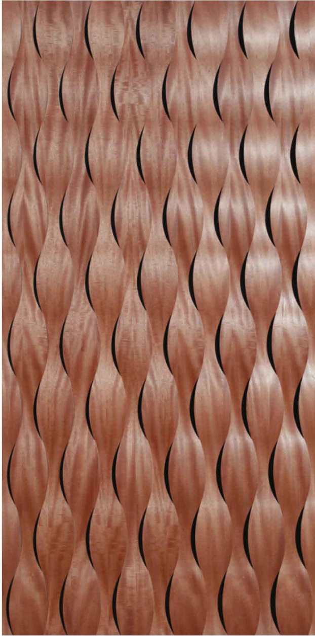
Full panel view