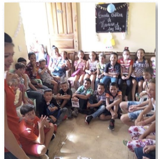
Childrens Ministry, Holy Trinity, Florida.