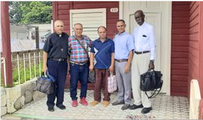
Florida Pastors' meeting.