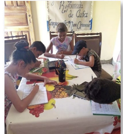
Children at San Lucas, Venezuela.