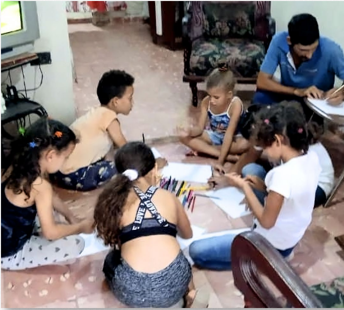
Cristo Redentor, Holguin

prayers and he indicated that they are keeping us in prayer as well.