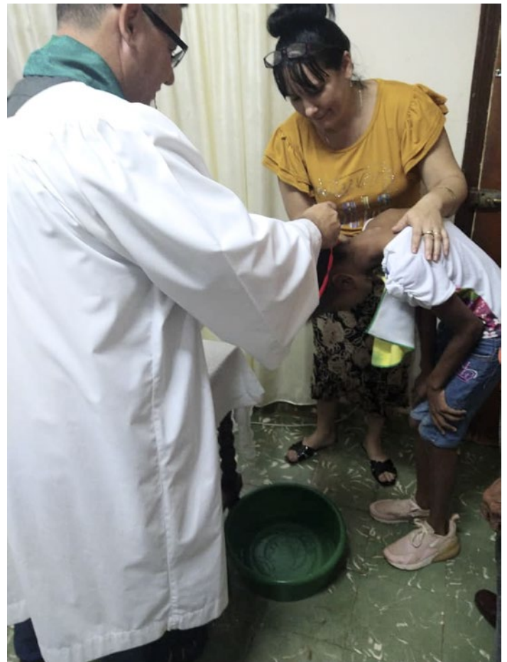
Baptisms at San Lucas.