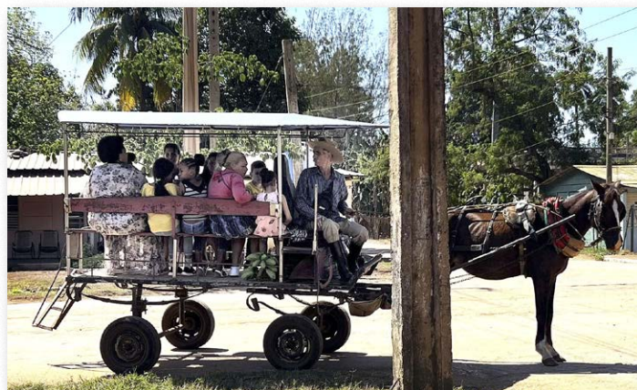
Children returning home from church on the "Sunday-school bus".