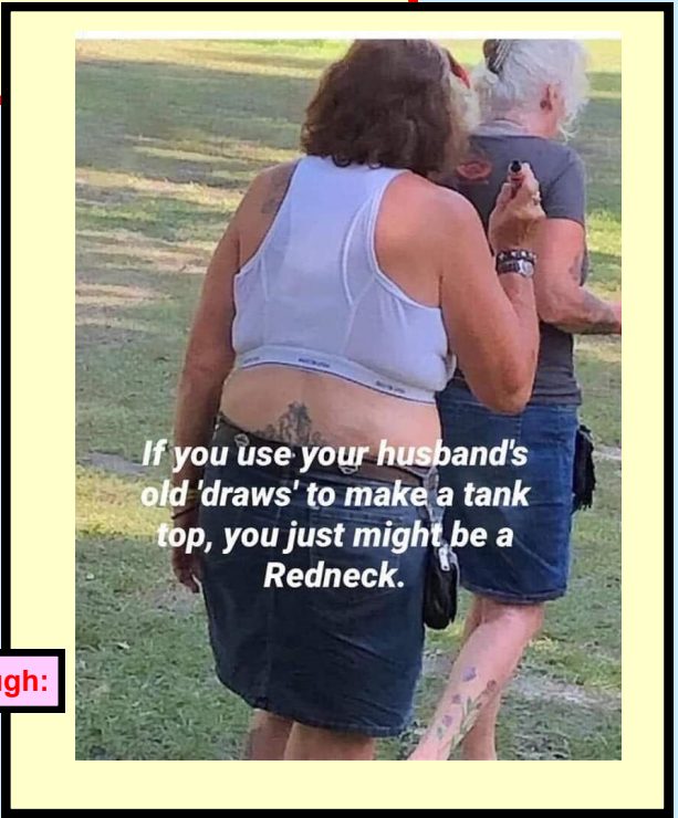
If you use your husband's old 'draws' to make a tank top, you just might be a Redneck.