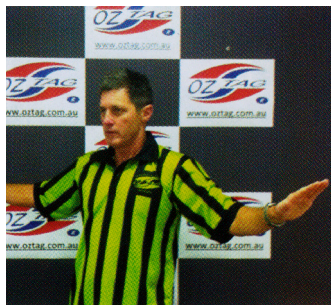
End of game – Stage 2