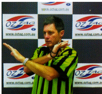
End of game – Stage 1