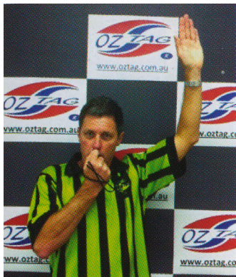
Kick off – commence game