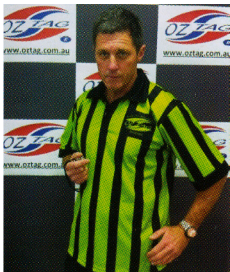
Late Tag – Stage 1