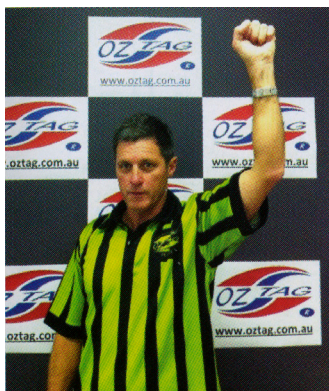
6 again – Stage 2