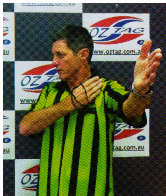
Offside – Stage 1