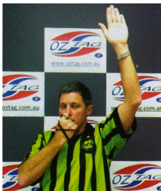
Stop play – Stage 1