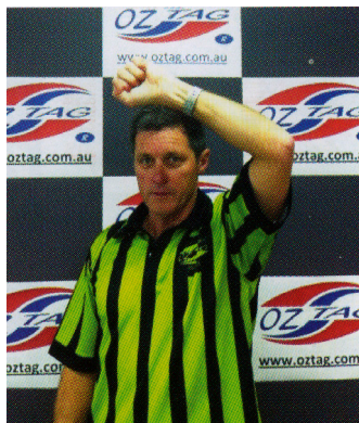
6 again – Stage 1