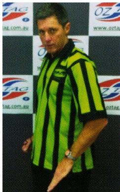
Fend – Stage 2