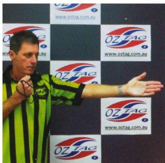
Forward pass – Stage 2