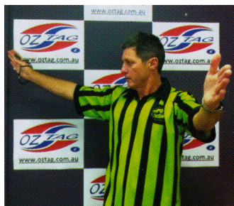
Offside – Stage 3