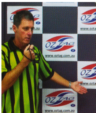
Forward pass – Stage 1