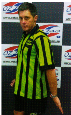
Fend – Stage 3