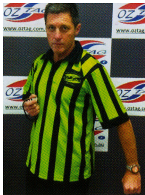
Late Tag – Stage 2