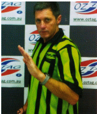
Fend – Stage 1