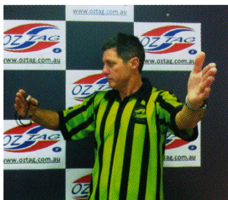
Offside – Stage 2