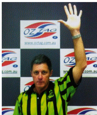
5th and last