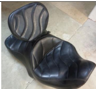
Hartco custom vinyl seat, heated, with rider backrest, matching co-rider backrest cover, rider's backrest storage pouch, new heating element and refreshed rider's seat foam done by Hartco, fits GL1800 2012-2017, original MSRP $1,500, asking $450.00/OBO