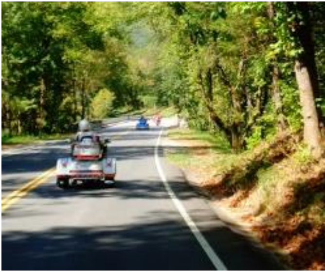
The Tail-gunner's view, see the 4 bikes ahead?