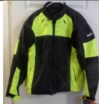
Bilt Spirit H2O jacket, lady's size large, brand new, MSRP $299.99, asking $75.