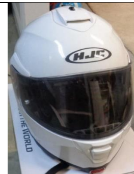
HJC IS-MaxII helmet, size L, includes interior drop-down sun-visor, almost new (bought at Spring Fling, April 2018, she broke her leg in May, didn't ride till Oct, a couple rides at the start of 2019), MSRP $415.00, asking $100.00/OBO