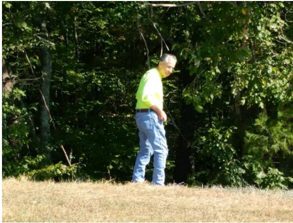
Wonder what is he planning on doing?????