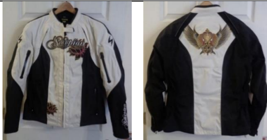
Ladies Scorpion Exo Skeletal jacket, waterproof, zip-out quilted liner, size large, almost new, only worn a couple times, original MSRP $220, asking $75.