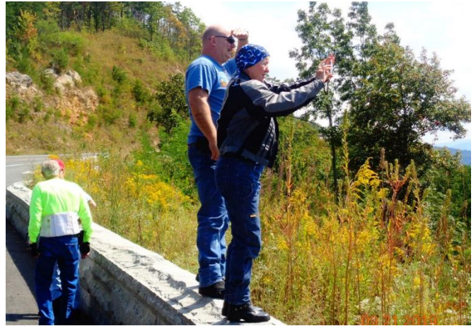
Please, just don't fall!