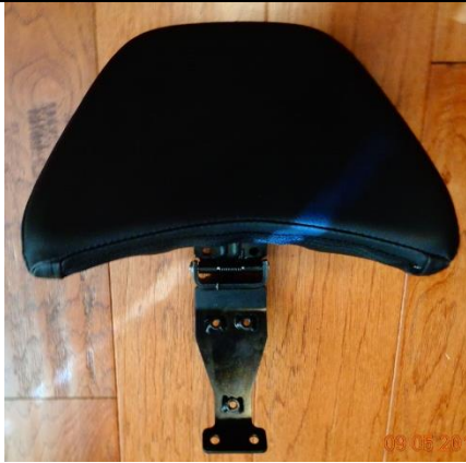
2018 Goldwing Tour stock seat rider's backrest, MSRP $278.55, asking $150.

Items for sale, contact Brian Richards, 865-249-6173 or barljr@att.net , NOTE, I have reduced several of the prices, so anything you think you might be interested in, recheck, and negotiate!