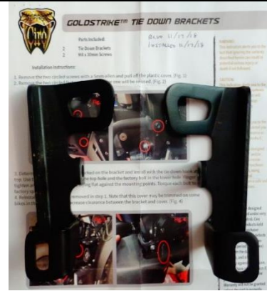
2018 Goldwing "Goldstrike" tie-down brackets, MSRP $50, asking $25.