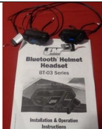
J&M BT-03 Bluetooth helmet headset conversion kit, excellent condition, barely used, almost new, MSRP $320.00 for the pair, asking $150.00/OBO