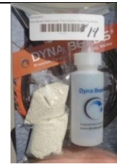
Dyna Beads for tire balancing, new, (with TPMS system in our bike, we can't use these), asking $10