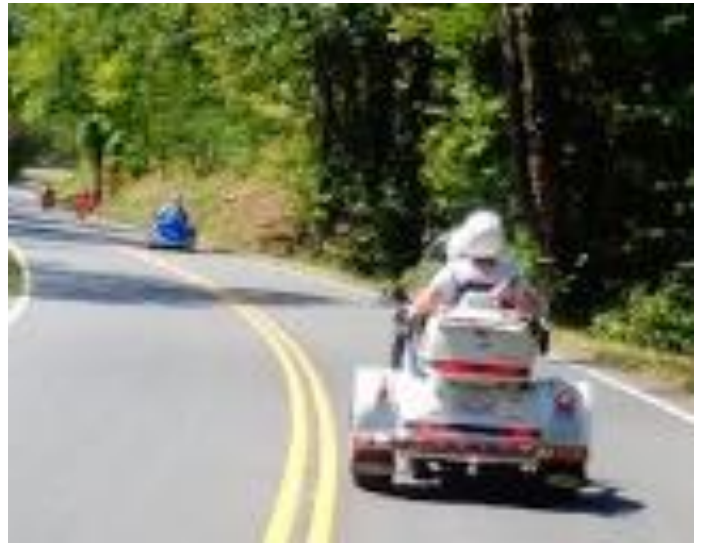
The Tail-gunner's view, see the 4 bikes ahead?