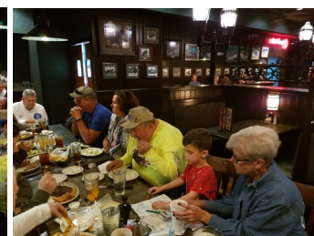
Dinner at Legends in Shelbyville