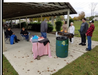
Cool Day for a picnic