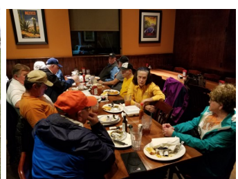
Dinner at Western Sirloin