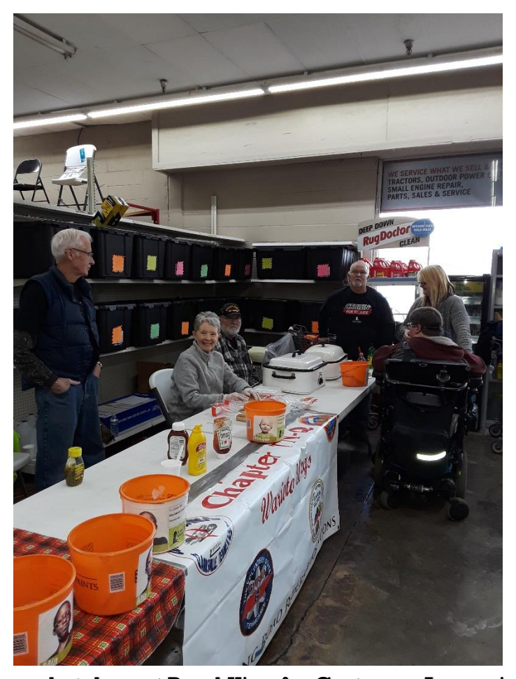
Chapter Q Members serve hot dogs at Rural King for Customer Appreciation Day! This event is used to collect money for Chapter Q's charity, St. Jude's Children's Hospital.