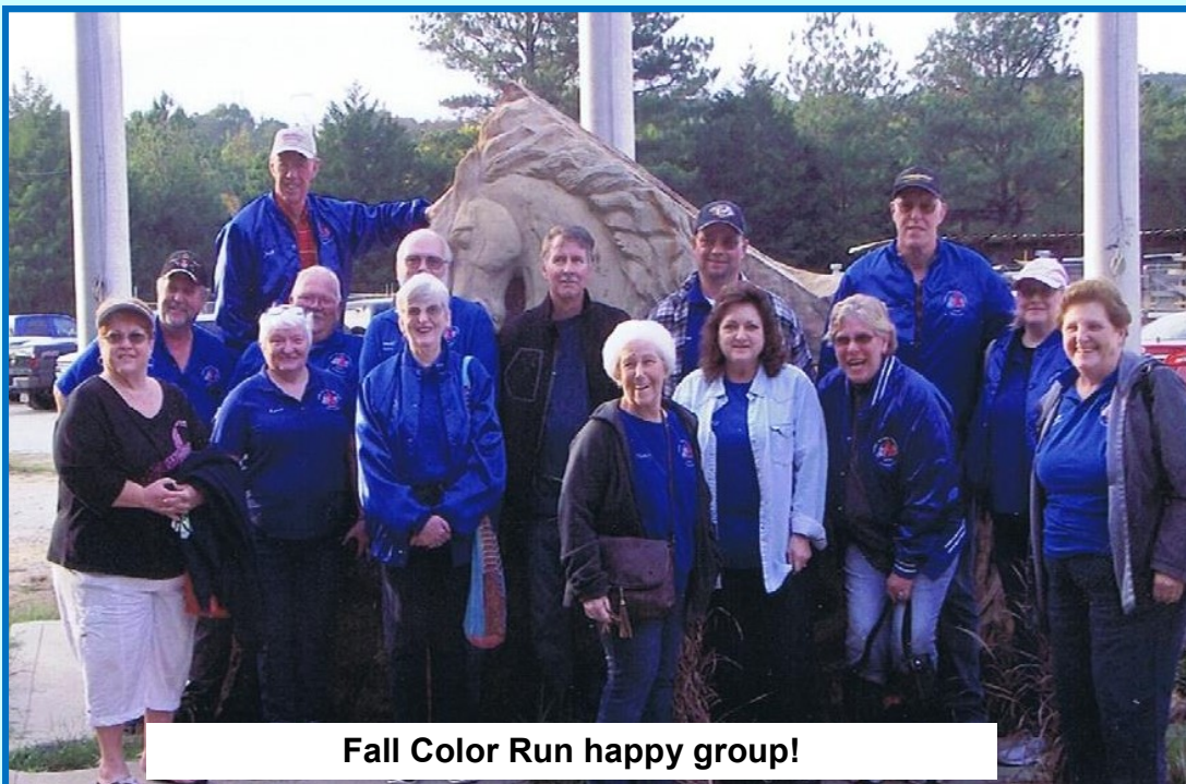
Fall Color Run happy group!