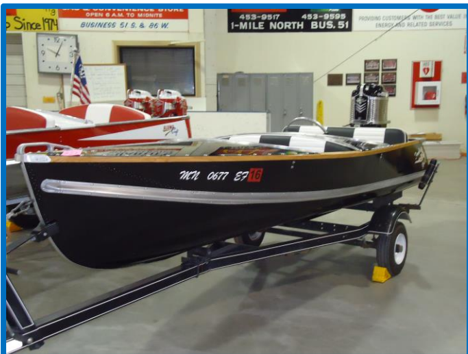
Wyman Entry 2 Best of Show