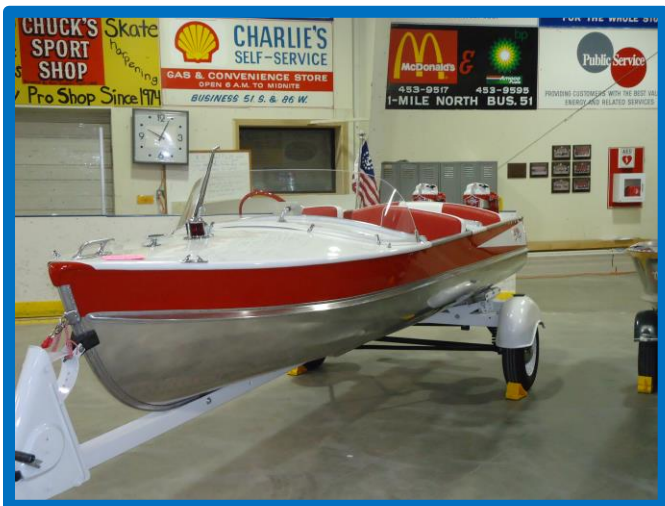
Wyman Entry #1

Oct. 19, 2014 BSLOL Fall Colors cruise call Clark Oltman for details.