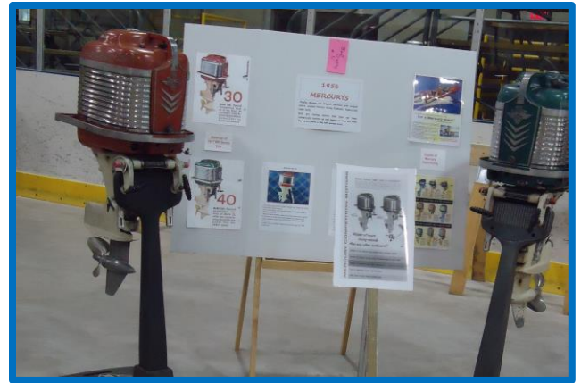
Langer—Melick Display entry--3 rd Place