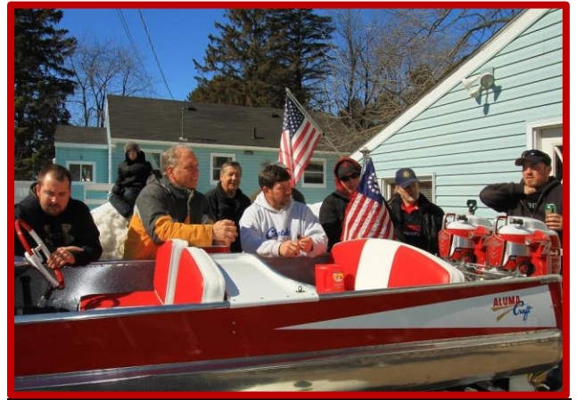
Wyman Meet 2014