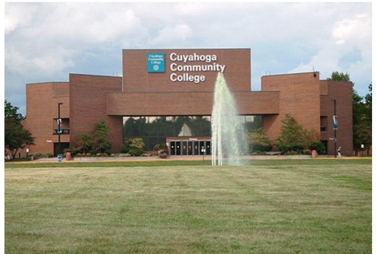
The beautiful Western Campus of Cuyahoga Community College, Parma, OH.

The Spring schedule has me teaching one six-hour section of Fundamentals II and one three-hour course in College Composition I. I’ll have to bide my time till an opening occurs in the Religious Studies Department. I would really like to teach that department’s Religious Experience course.