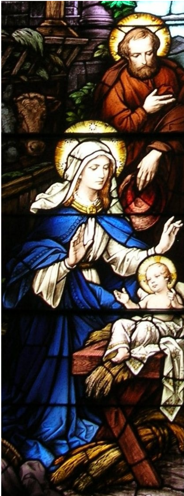
Nativity Window, St. Patrick Church, Oneida, NY