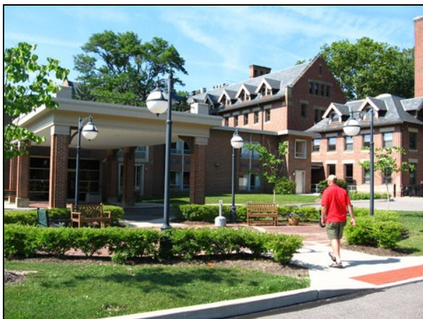
Sisters of St. Joseph, Rocky River Drive, Cleveland