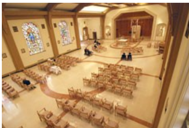
Chapel at the Regina Health Center, Richfield, OH

the Ursuline Sisters at their Motherhouse in Pepper Pike on the second Sunday, and with the residents of the Regina Health Center on the third Sunday of the month. The fourth and fifth Sundays will be set aside for assistance in local parishes and, after Easter, for possible Food for the Poor appeals at parishes within driving distances.