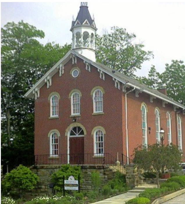
Looks like a church, but it's the Brecksville Theater on the Square.

This dark, adult comedy about a totally dysfunctional family will be staged at the Brecksville Theater on the Square the first two weekends of February. Stay tuned!