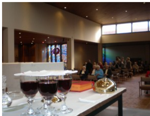
Chapel of the Most Holy Trinity Ursuline Sisters

A regular schedule of Sunday liturgies is planned beginning in January with the Sisters of St. Joseph on the first Sunday of the month,