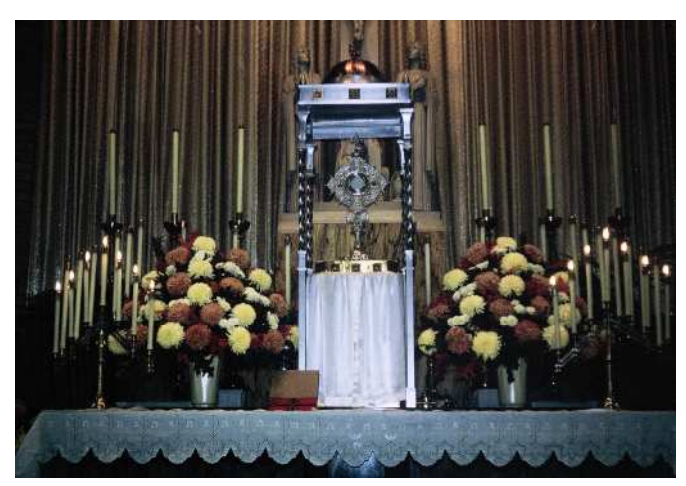
Traditional Forty Hours symbolized the parish's love for the Eucharist.