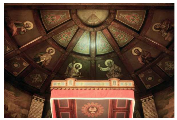
The ceiling throughout has painted pictures and symbols on choice mahogany.