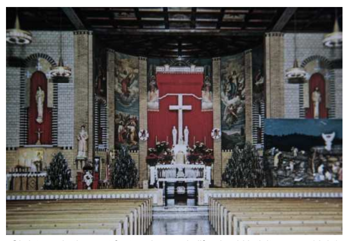
Christmas in the past featured a nearly life-sized Nativity scene (right).