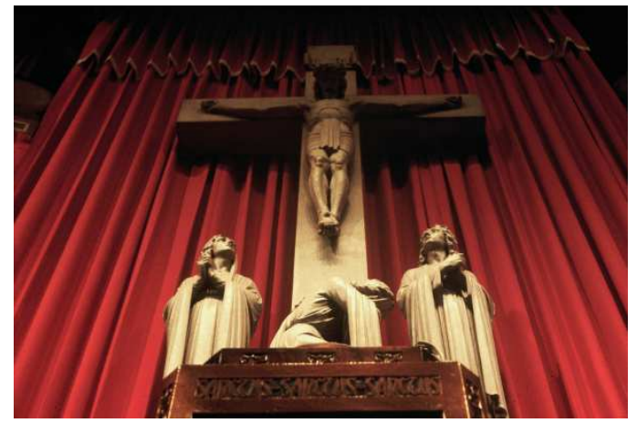
The stunning stone crucifixion scene towers over the brass tabernacle.

If you wish to donate to this special memorial, send your donation payable to Food for the Poor, 6401 Lyons Road, Coconut Creek, FL 33073. Indicate that the donation is for the St. Lawrence Memorial # 73307.