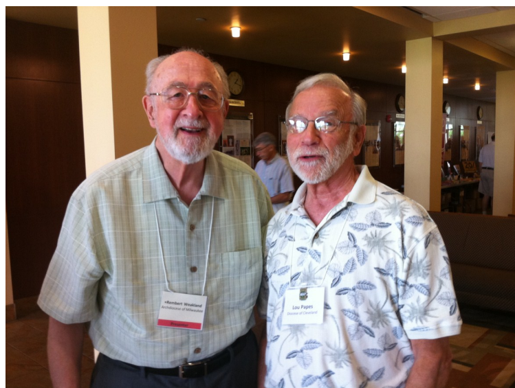
At the AUSCP Conference with Archabbot Rembert Weakland, former Archbishop of Milwaukee.