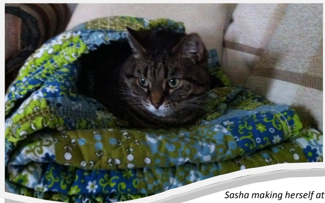
Sasha making herself at home.

For nearly two years now Sasha has been alone so I decided to get her "a Smokey." So Max, a four month old male who almost looks like Smokey, arrived two weeks ago. Max is wonderful, but Sasha is having a little trouble accepting him. But with a little bribery (a treat every time she "kisses him!") I hope she comes around.