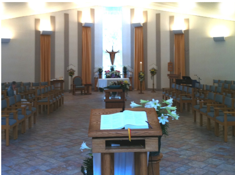
The contemporary and prayerful worship space of the Sisters of St. Joseph.

Since retiring a year and a half ago, I have been ministering to four religious communities: the Sisters of St. Joseph in Cleveland, the Ursuline Sisters in Pepper Pike, the Carmel of the Holy Family in Cleveland Heights, and the Regina Health Center in Richfield.