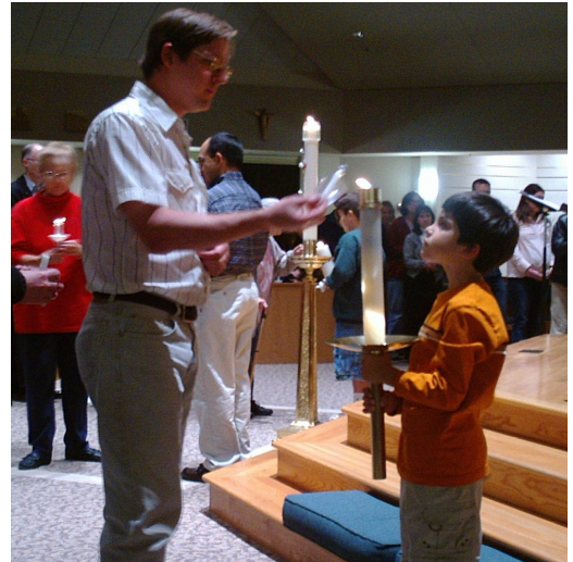
By this deed may I heal the wound I have caused."