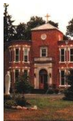
Our Lady of the Pines Fremont, OH