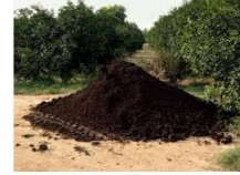
Organic Cow Dung Fertilizer

ECPN waste bank target 2billions Kg. waste to recycle every year.