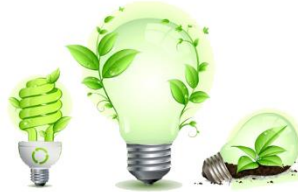
WASTE TO ENERGY