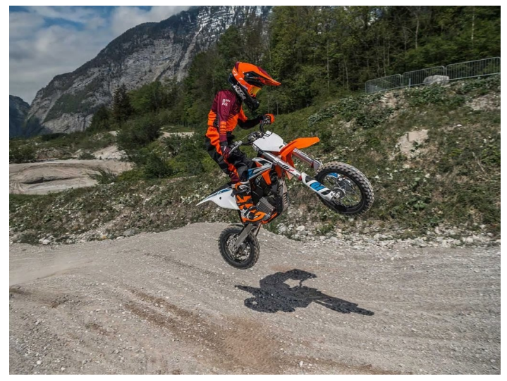
In action, the 2020 KTM SX-E 5 electric mini doesn't look much different than its premix-burning brother, the 50 SX.