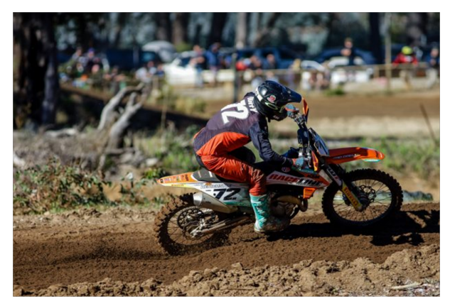
Youthful talent on his 2019 Manjimup 15,000 victory, presented by Maxima Racing Oils.

Fresh from taking a stunning victory at the prestigious 2019 Manjimup 15,000 in Western