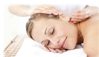
Traditional Acupuncture $30/PER TREATMENT

Achieve healing by licensed Acupuncturist traditional Chinese medicine. Allergy, stress, insomnia, pain control, lack of energy, work injury, car accident!