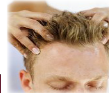
Hair Renewal (herbal) $15/PER TREATMENT

Oriental Acupressure $40/HOUR Foot Massage - $20/HOUR Combo Massage - $25/HOUR