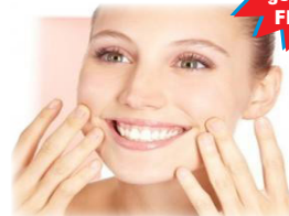
Acupuncture for Beauty $15/PER TREATMENT