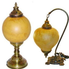
Table Top and Swan Neck Cut & Cleaned Gourds for lamps sold separately