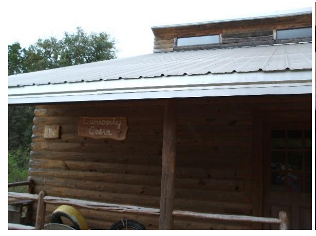
Curiosity Cabin – where we had Spring meeting