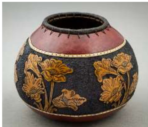
Blanche Cavarretta Vessels, Vases, Bowls, Containers