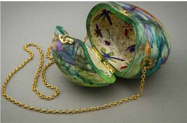
Zeldajean Byrd Wearable