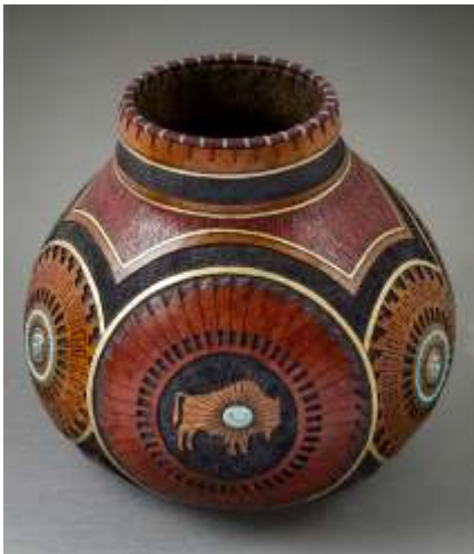
Roy Cavarretta Southwest / Native American Inspired