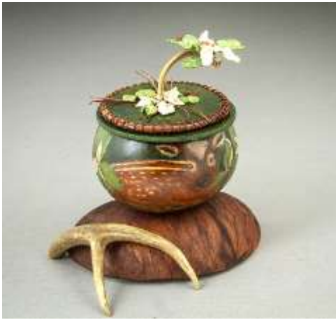
April Boyd Animal Design