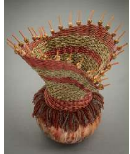
Shelia Guidry Fiber Works