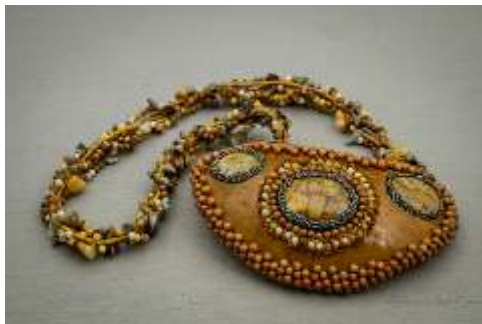
Joanne Tompkins Wearable