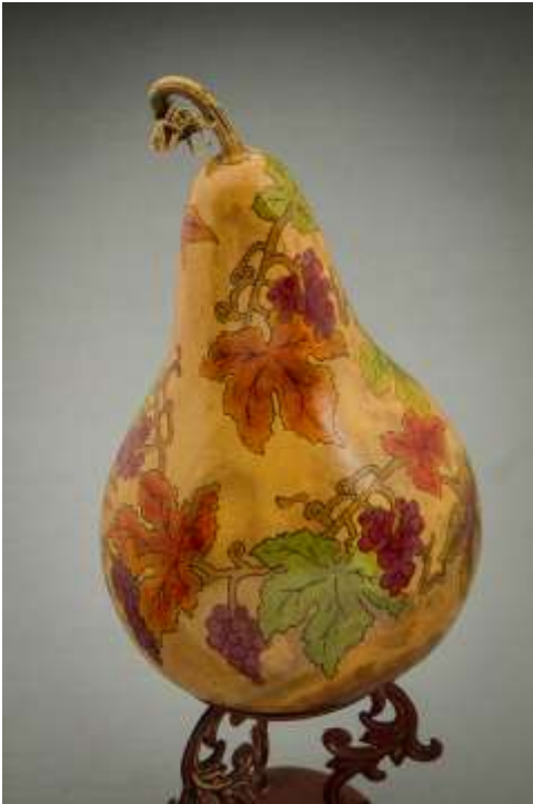
Becky Klix Painted