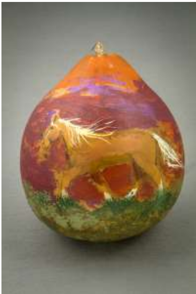
Elena Spenrath 8 and Under