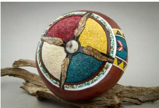
C C Rice Southwest / Native American Inspired