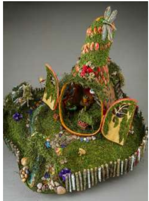
Karen Knight Fantasy / Whimsical