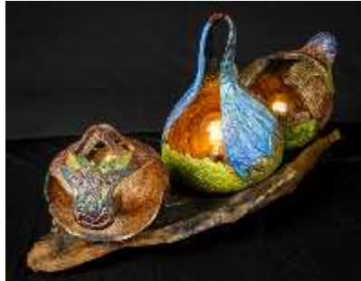
Connie Fox Fantasy/Whimsical