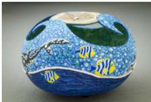
C C Rice Fantasy / Whimsical