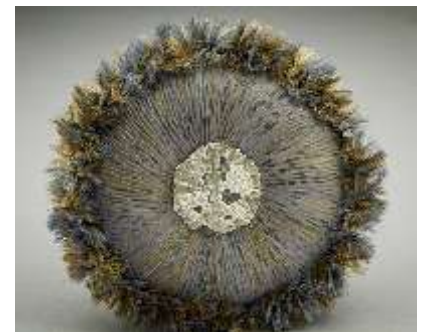
Cheryl Trotter Mixed Media