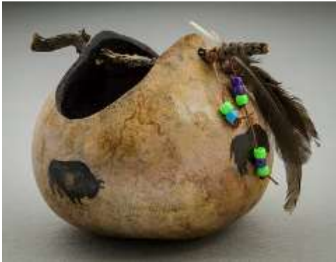
Cathy Cox Southwest/Native American Inspired