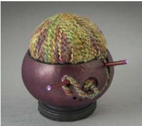
Gloria Drab Fiber Works