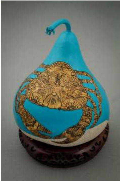
Sammie Roye Pyrography