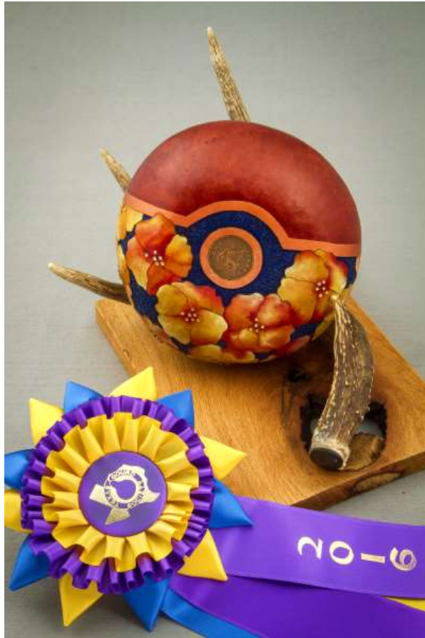
Best of Division C C Rice Mixed Media