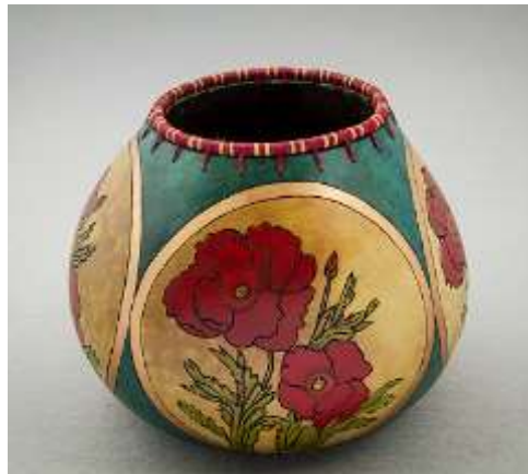
Blanche Cavarretta Painted