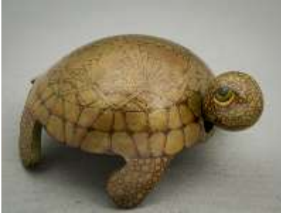
Judy Byrnett Gourd Doll/Spirit Figure